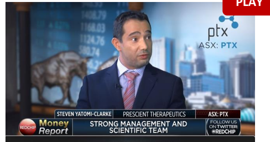
Prescient Therapeutics Interview (ASX: PTX)