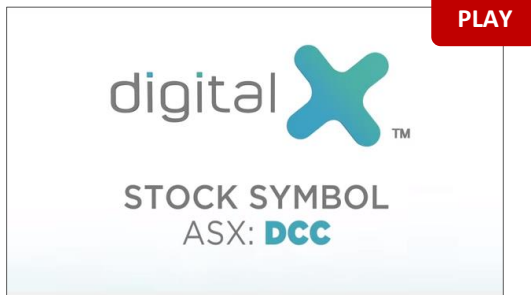
DigitalX Micro Ad (ASX: DCC)