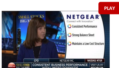
Company: Netgear(NASDAQ: NTGR) Product Type: CEO Interview