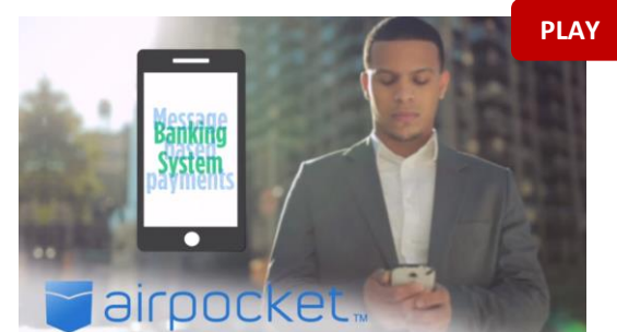
Air Pocket Product Video