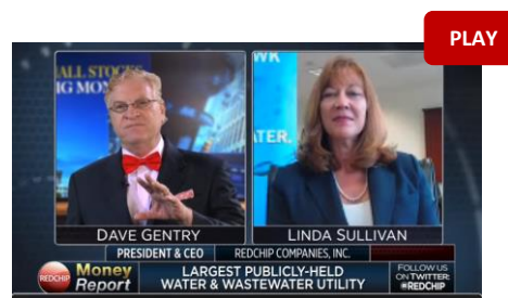
Company: American Water (NYSE: AWK) Product Type: CEO Interview