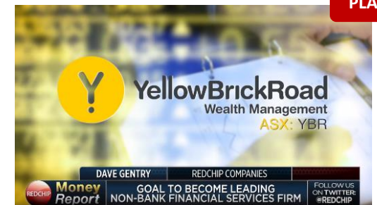
Yellow Brick Road Interview (ASX: YBR)