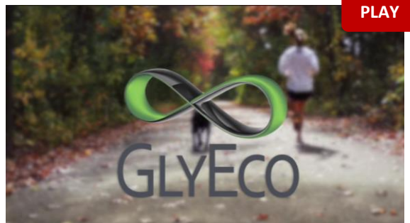
Corporate Video GlyEco (OTCQB: GLYE)