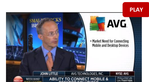
Company: AVG (NYSE: AVG) Product Type: CEO Interview